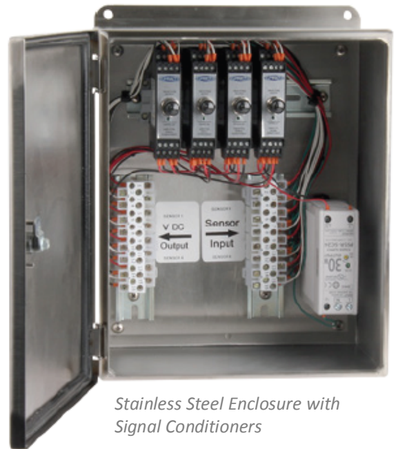
Stainless Steel Enclosure with Signal Conditioners

If notice of withdrawal is given in writing - 14 calendar days before the course date, 80% of the course fee will be refunded. A 50% refund will be made for cancellation received in writing – 7 calendar days before the course date. After which, NO REFUND will be entertained.